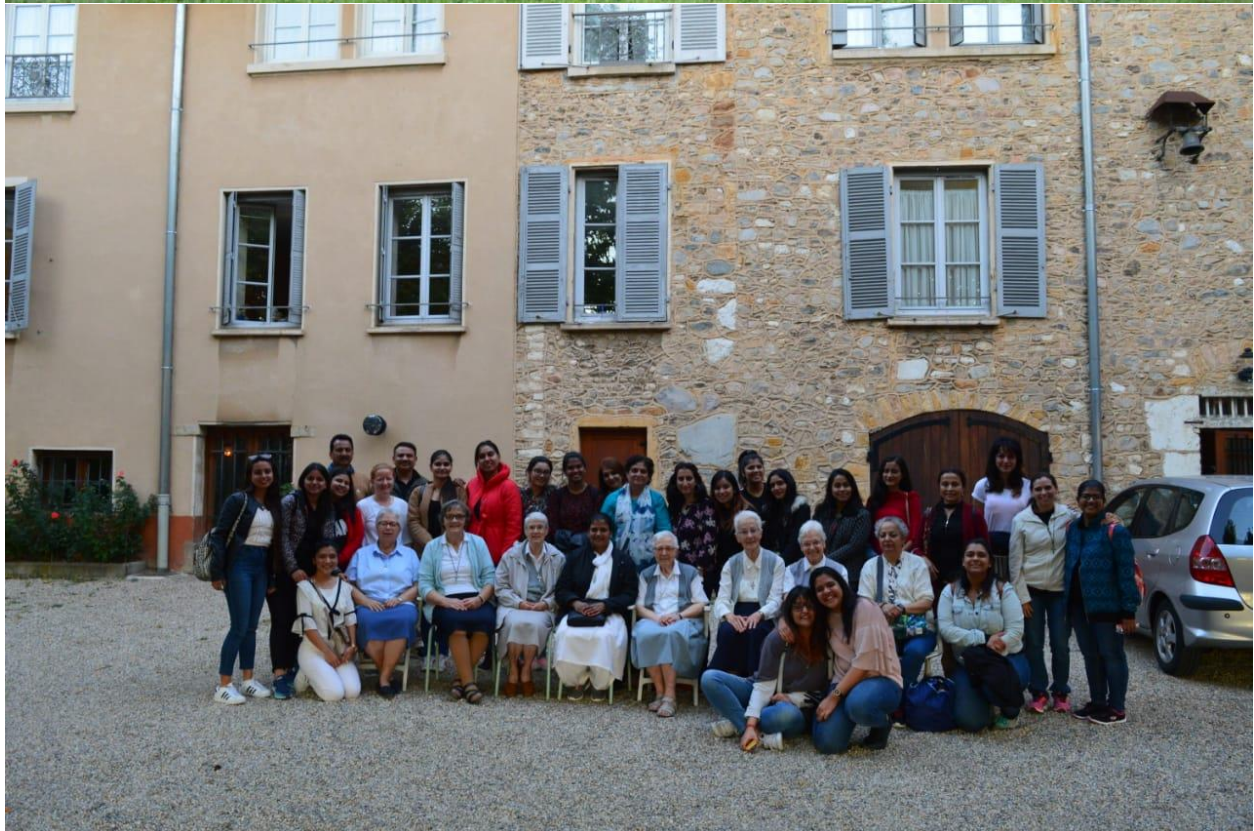
The students and teachers with the sisters at Lyon France.