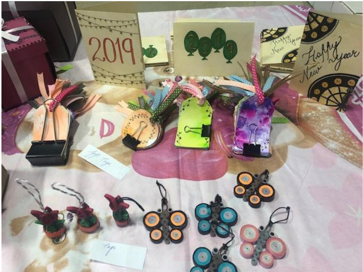
Articles prepared by the home science students.

A discussion regarding various nutrition related diseases was held with the students of MSc (DFSM), IGNOU during their counselling session on September 17, 2018