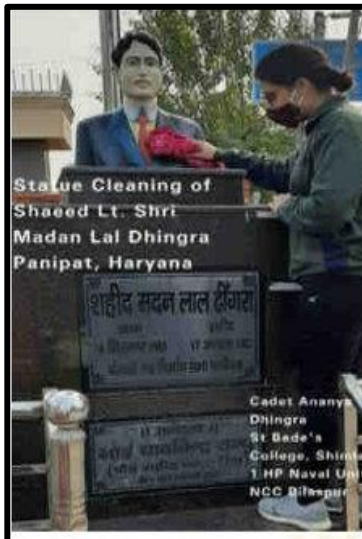
Statue Cleaning of Shaheed Lt. Shri Madan Lal Dhingra Panipat, Haryana