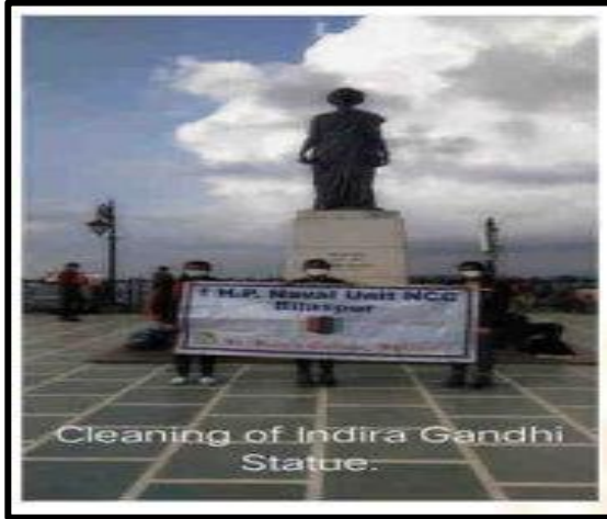
Cleaning of Indira Gandhi Statue.

St. Bede's College Shimla - 171002 (UGC-NAAC "A+" Grade Re-Accredited) College with Potential for Excellence Phone: 0177-2842304, Fax:- 0177-2842498 www.stbedescollege.in, E-mail:- bedescollege@gmail.com