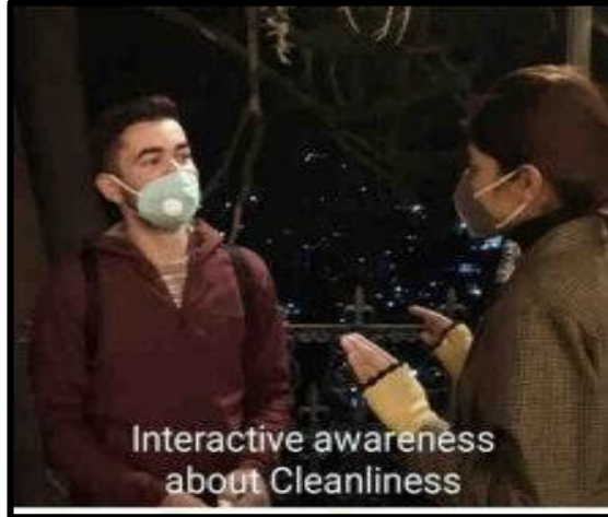
Interactive awareness about Cleanliness