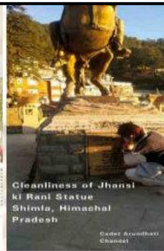
Cleanliness of Jhansi ki Rani Statue Shimla, Himachal Pradesh