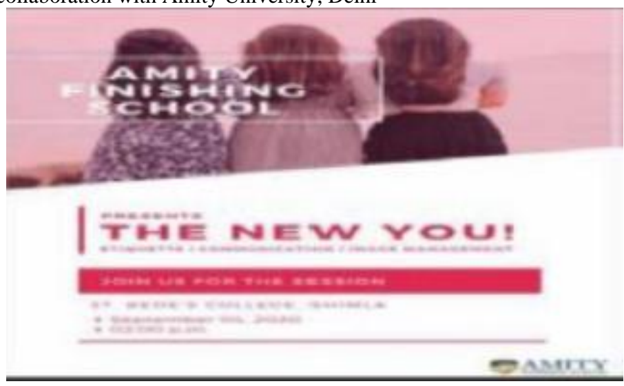
Webinar on 'Social Manners'

On 4<sup>th</sup>September 2020, a webinar on 'Social Manners' was organised by the Department of English in collaboration with Amity University, Delhi