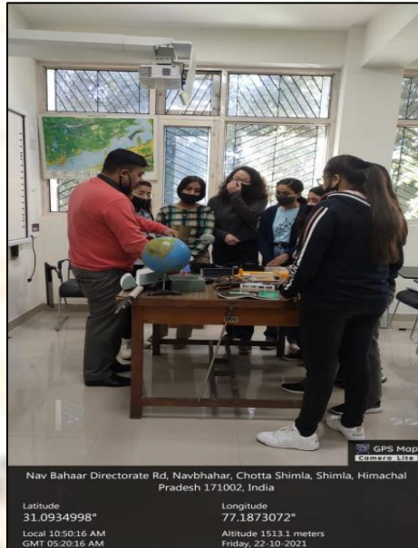
Demonstration of various instruments