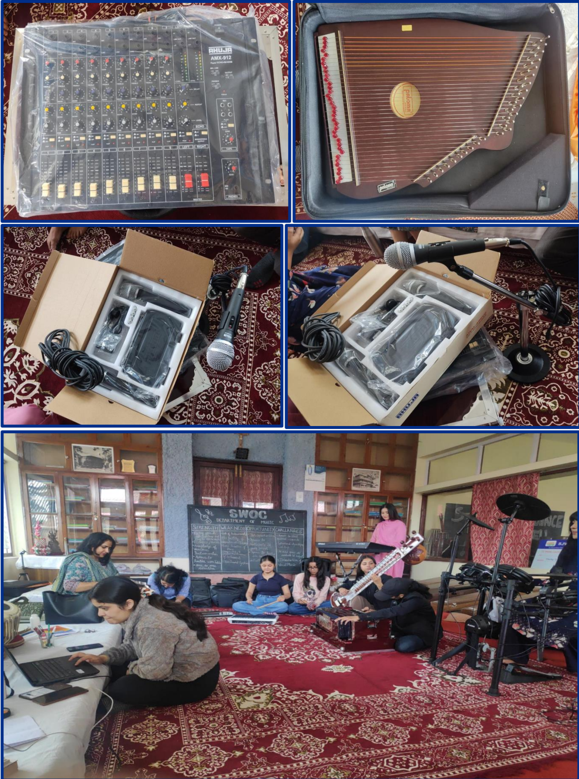
New Instruments in Music Room