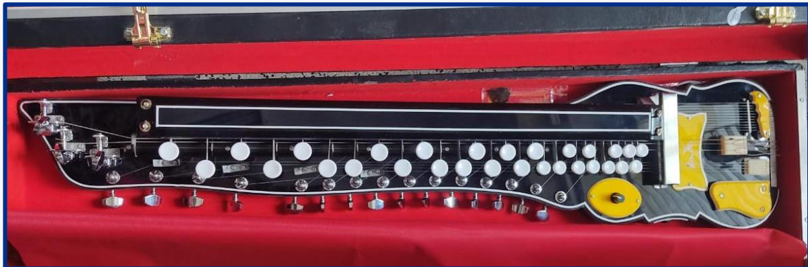
New Instruments in Music Room