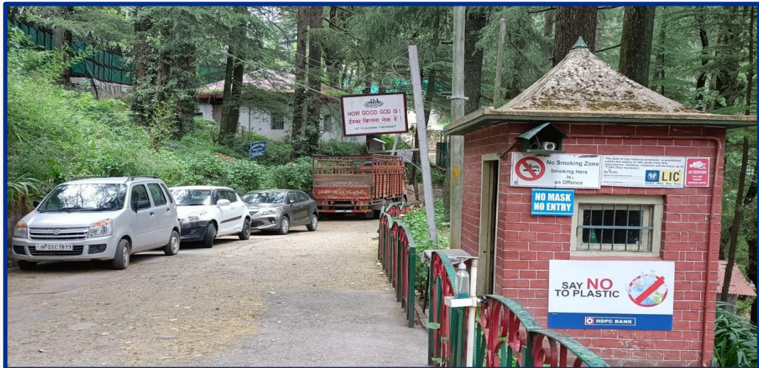
Security And Surveillance Systems