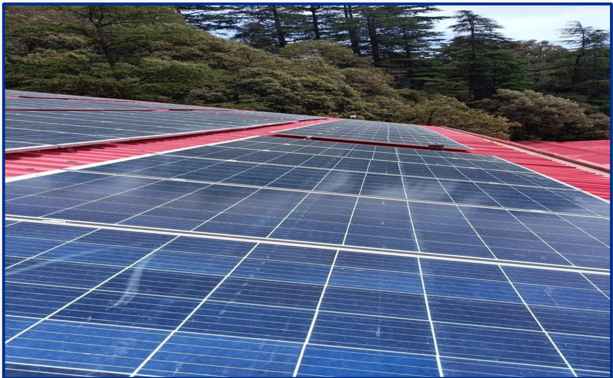
Solar Panel Installation