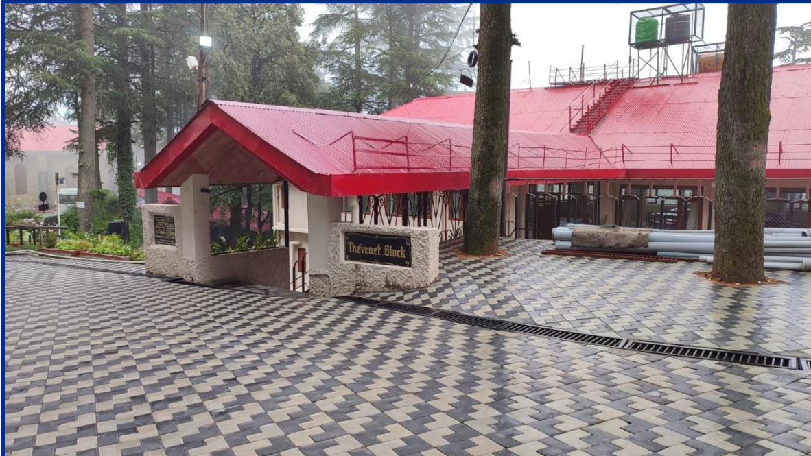
Renovated Hostel/Thevenet Block