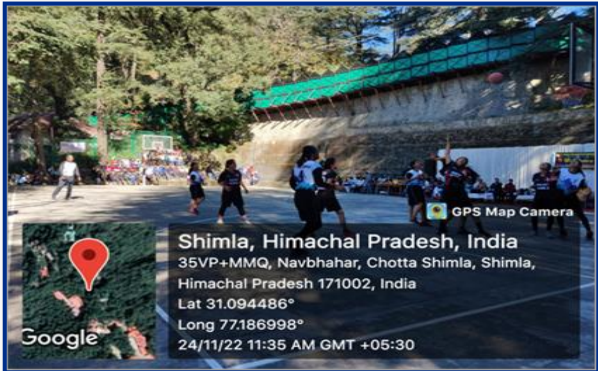
Renovated Basket Ball Court