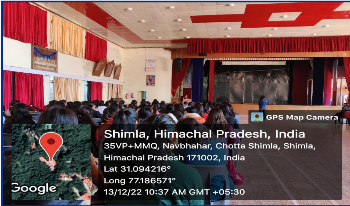
Renovated Multipurpose Auditorium