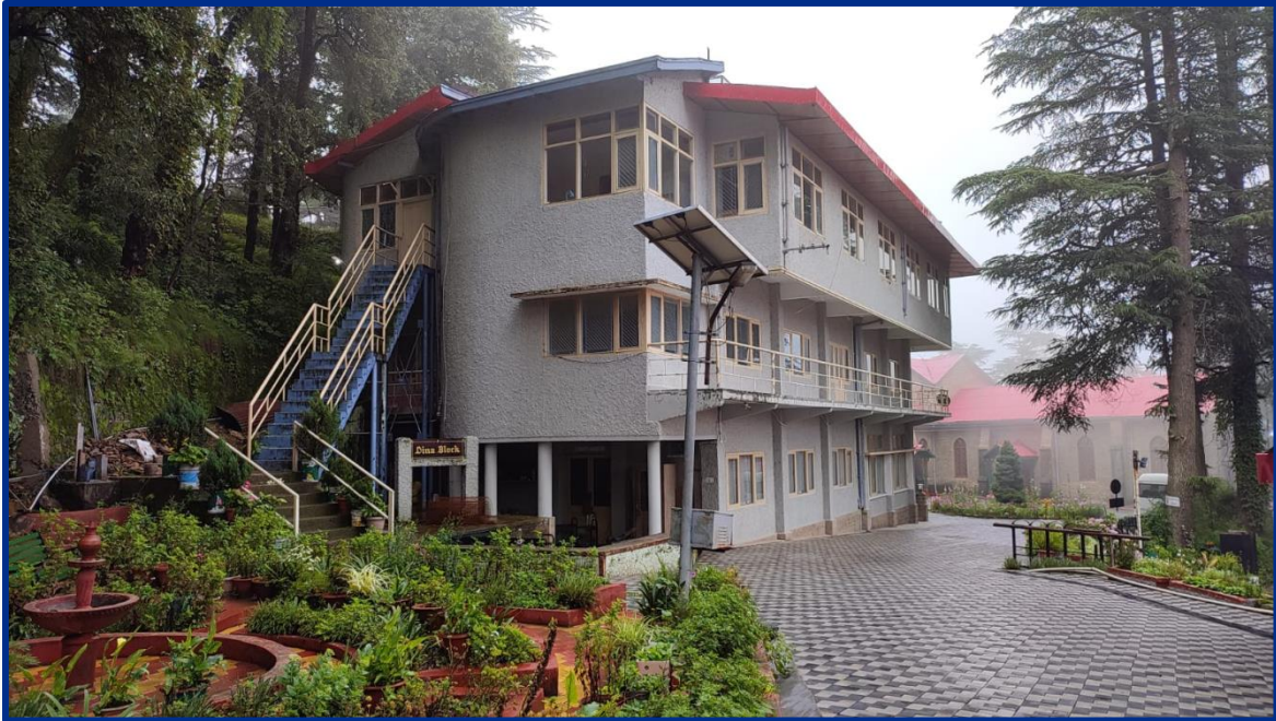
Renovated Dina Block