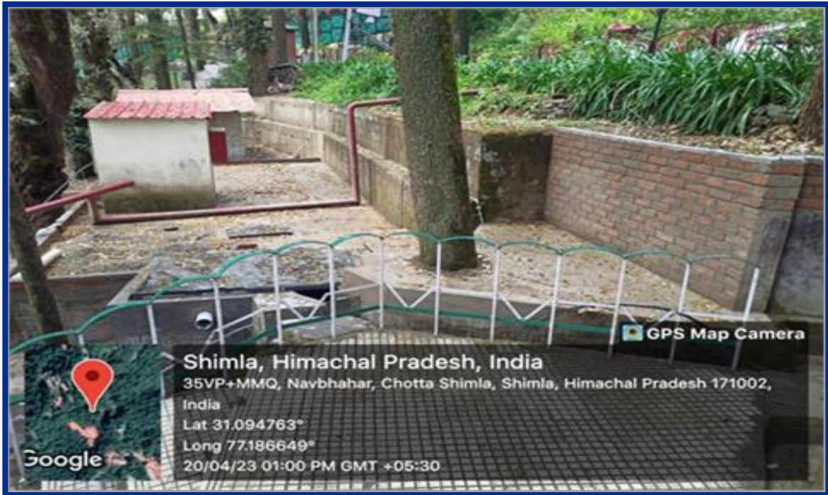
Renovated Rainwater Harvesting Unit