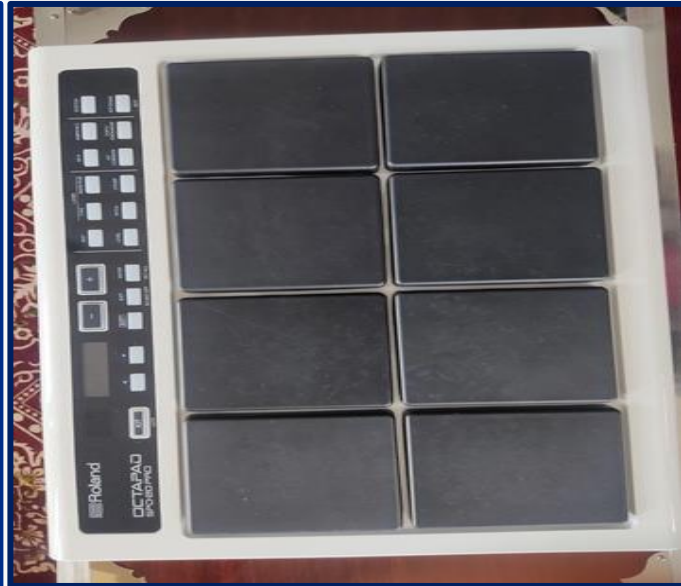
New Instruments in Music Room