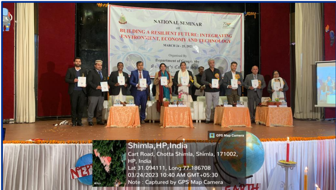
National Seminar on “Building A Resilient Future: Integrating Environment, Economy and Technology” (March 24-25, 2023)