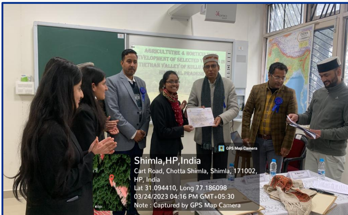
National Seminar on “Building A Resilient Future: Integrating Environment, Economy and Technology” (March 24-25, 2023)