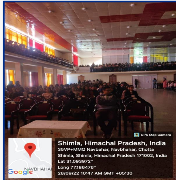
Workshop on "Career Guidance and Counseling" (September 28, 2022)