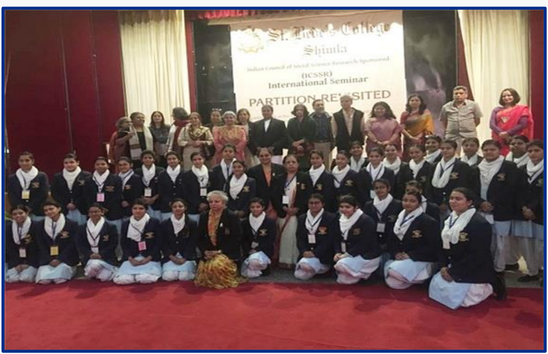
International Conference Partition Revised (September 19, 2018)