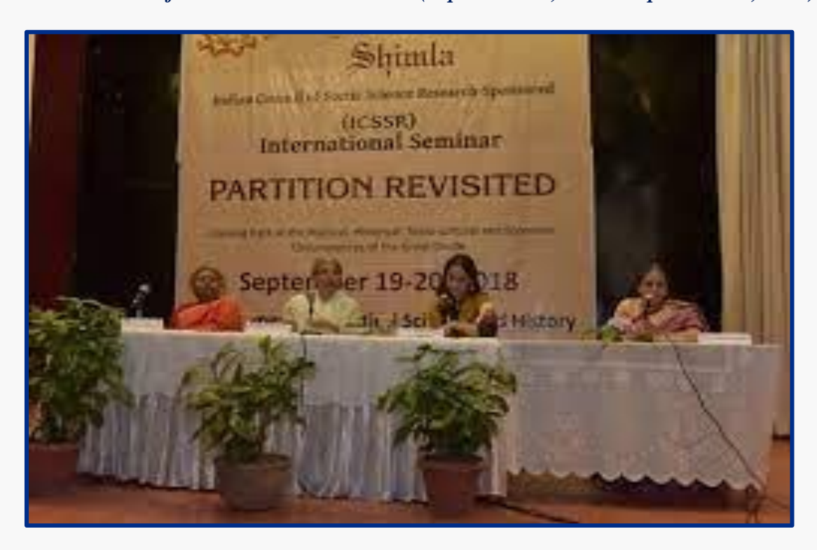
International Conference Partition Revised (September 19, 2018)