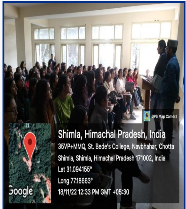
Workshop on "How to Crack Bank Exams" (November 18, 2022)