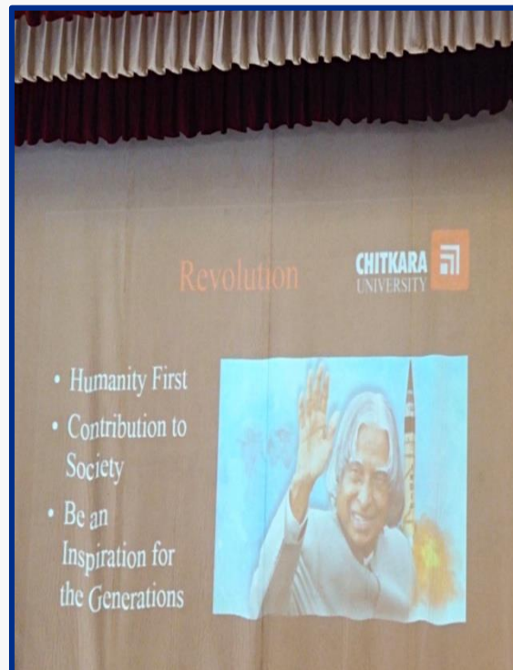
Seminar on "Career Counseling" (February 20, 2023)