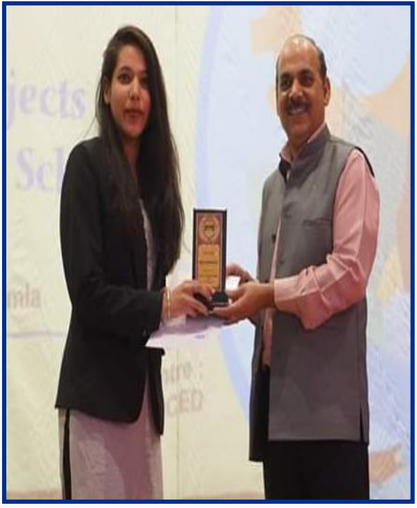
Workshop on Start-up Programmes and Entrepreneur Development on (September 3, 2019)