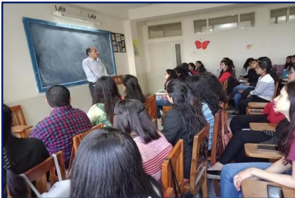
Seminar on Leadership and Management Skills