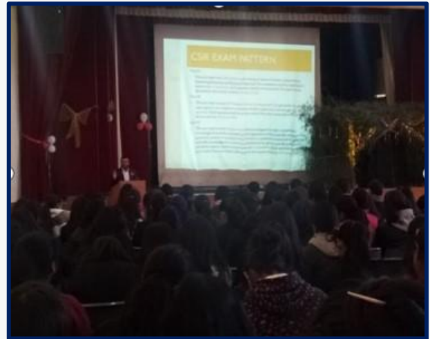
Workshop on Career and Guidance Counselling