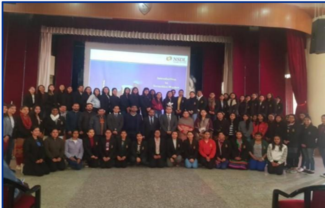
Workshop on National Securities Depository Limited