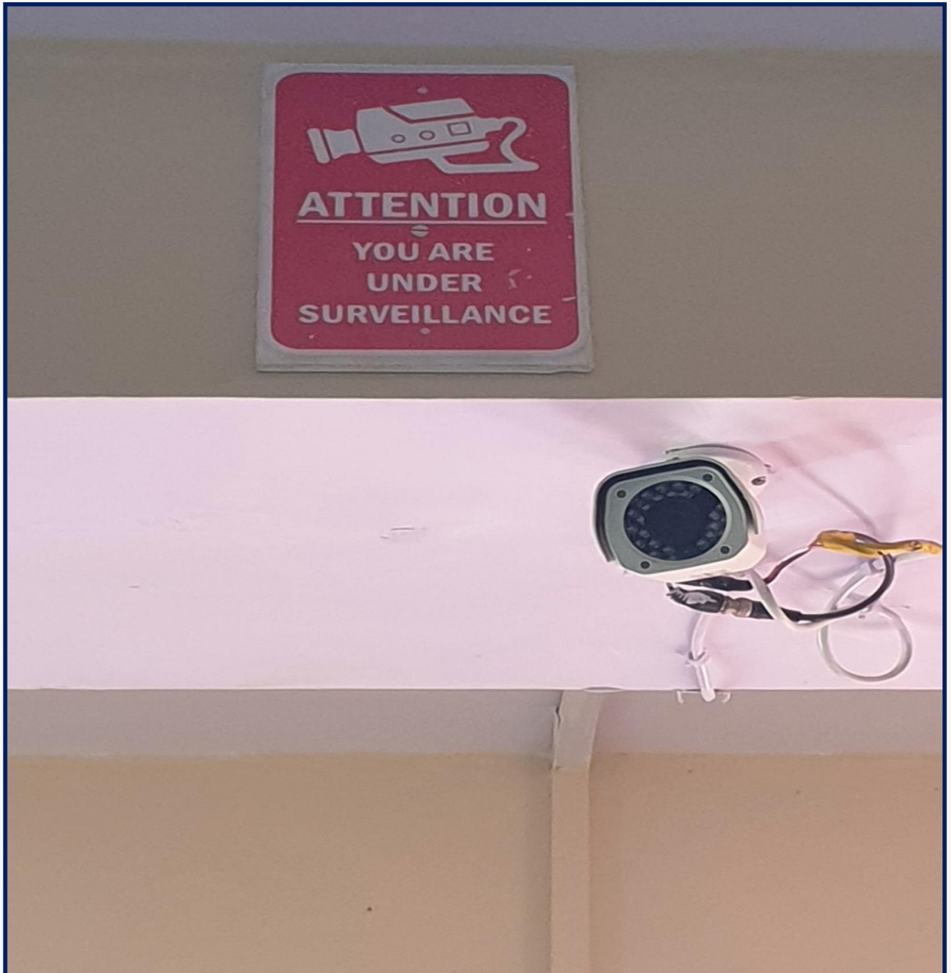
CCTV Surveillance for Monitoring Ragging