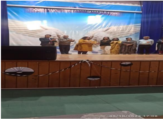
Students receiving prizes