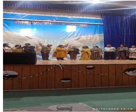
Students participating in various competitions