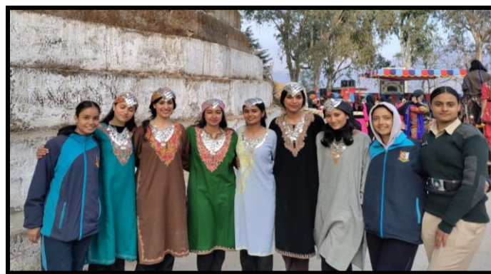
Cadets participating in the Cultural Events During the Camp