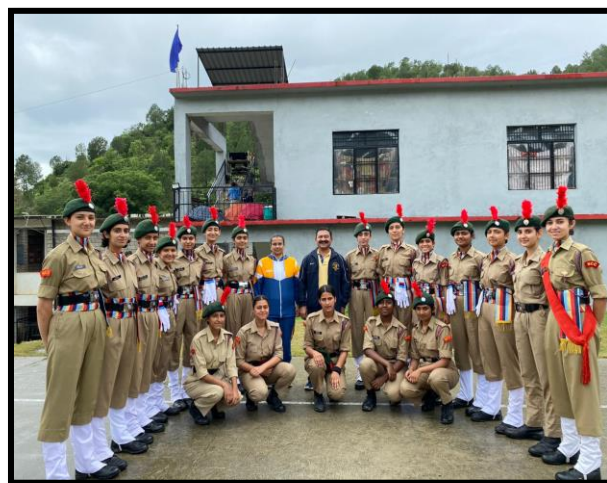
Cadets During the Camp