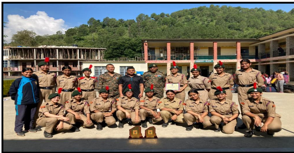
Cadets During the Camp